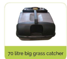
70 litre big grass catcher