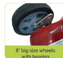
8" big size wheels with bearing