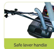
Safe lever handle