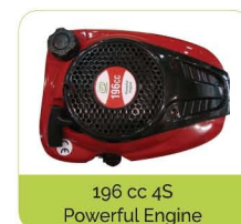
196 cc 4S Powerful Engine